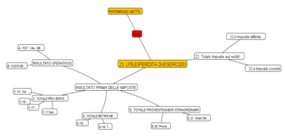
Figure 2: Visual representation of the hypertree for ROE.

As example, in Fig. 2 is shown the interactive hypertree of ROE. The hypertree can be browsed by selecting which node of the structure is the focus of the analysis.