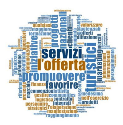
Figure 3: Word cloud for SA agreements' goals.

Finally, for the analysis of goals we propose to adopt information visualization techniques based on content analysis and text mining methods.