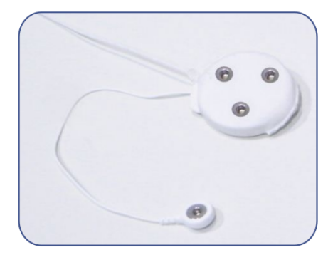
Fig. 2. Photograph of the localized EEG sensor.

The standard procedure for this sensor is to use Ag/AgCl pre-gelled electrodes and a band strap over the sensor to enable an appropriate setting and contact with the scalp. The ground electrode sticked to a bone surface, behing the ear.