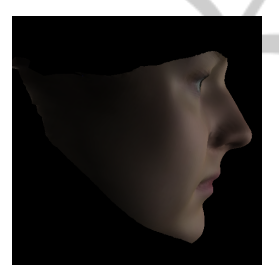
(d) Model only: front (e) Model only: profile view.