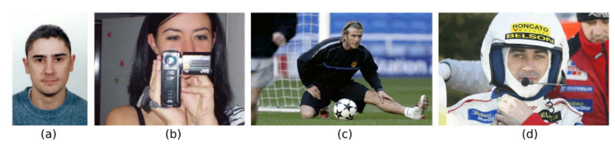
Figure 6: Considered test images: (a) Javi, (b) photo, (c) Beckham, and (d) CSainz.