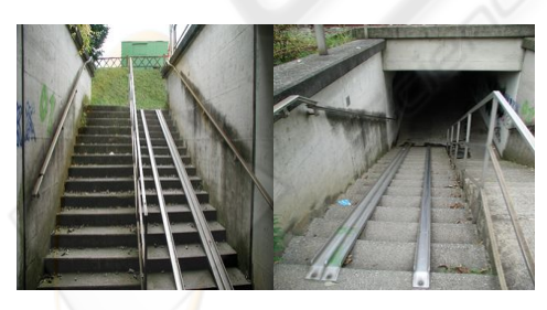
Figure 3: Examples of misclassified images.