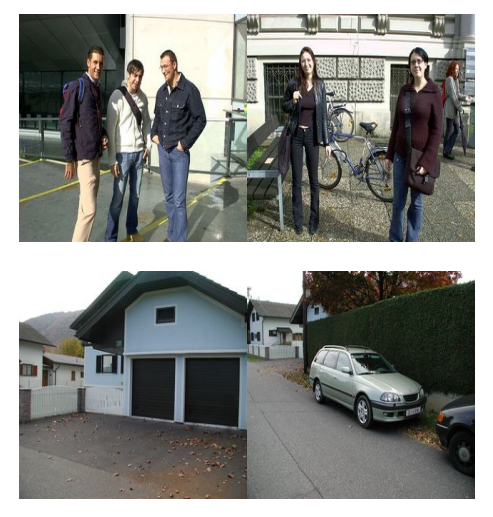
Figure 2: Examples of well classified images.

Hereafter, examples of well classified and misclassified images are given for both classes (Face/Non-Face). For instance, the images below, have been well classified: