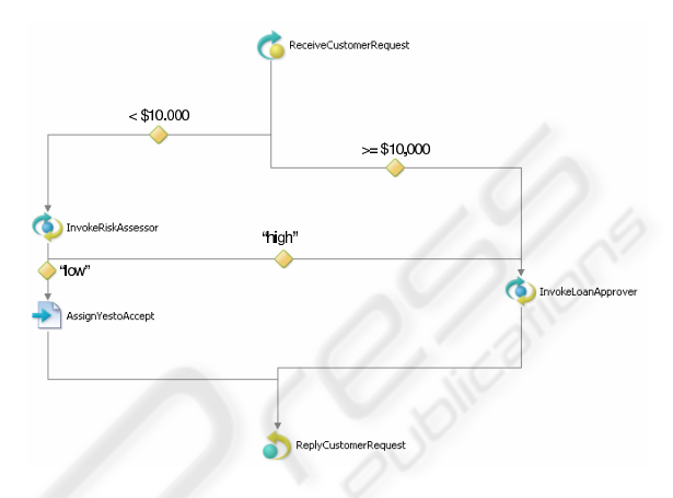
Figure 5: The work flow of the loan approval BPEL Process.

ther "yes" or "no"), which is then sent as reply to the customer (AcceptMessageToCustomer). Both the risk assessor service and the loan approver service can also return a predefined fault message to the BPEL process. When any of these services reply with a fault message, the BPEL process sends an error message to the user and terminates (not shown in the figure).