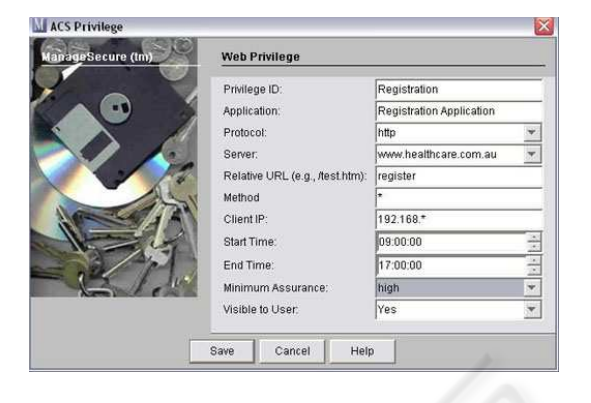
Figure 3: Web Privilege Configuration.

Web Roles are actually organizational roles, and roles are in-turn mapped to privileges. So, a user can