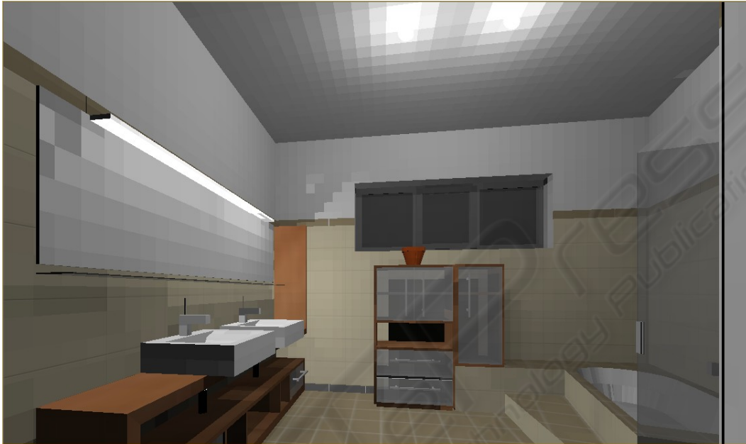
Figure 2: Hardware accelerated combination (No bilinear filter as GeforceFX does not support this for float-textures), combination every frame - 25fps.