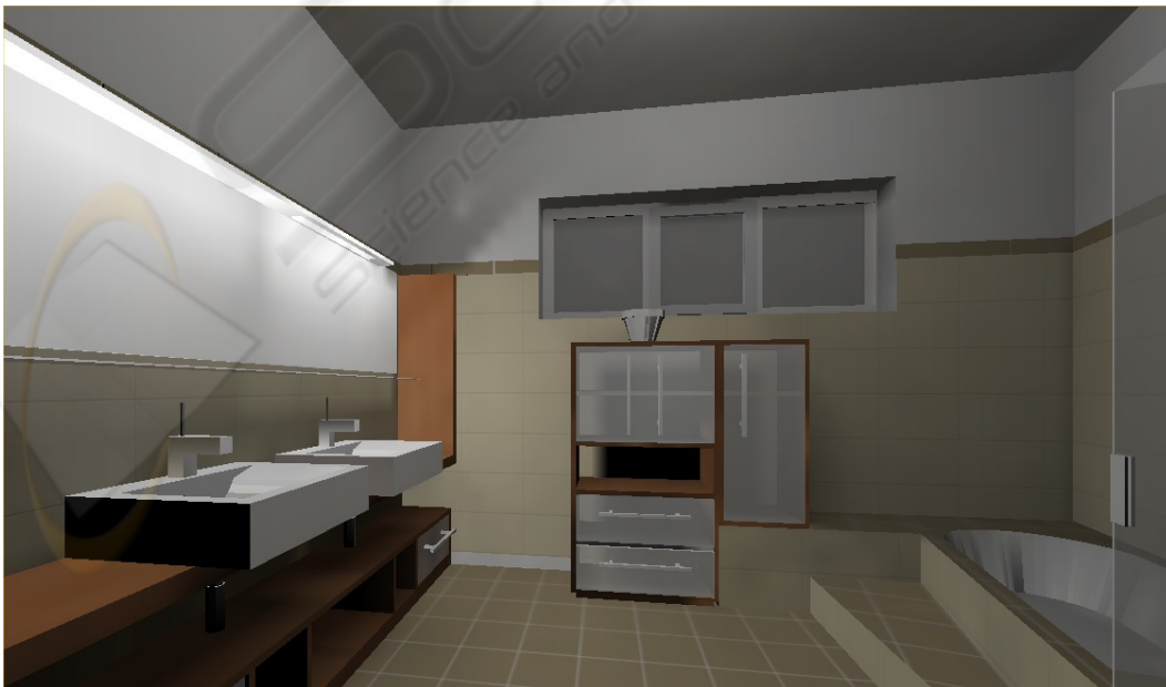
Figure 3: Software fallback for combination, one combination at beginning - 36fps.