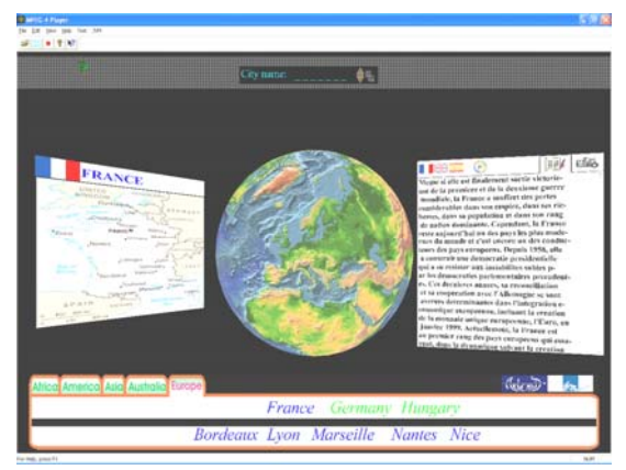
Figure 4: Information Display in French.

In the framework of ITEA project "Jules Verne", an MPEG application has been developed. This application shows an interactive globe in the middle of the screen and two other display boards on either side of the globe. In the display board on left, it shows the map of the country chosen and on right side it shows the historical information about the country chosen. This also has some flags on the display board on right. User can click on any of the flags and the historical information is displayed in the chosen language. This information is encoded in XLIFF/MLIF document (both formats are completely interchangeable with the help of stylesheets). This information is extracted from the document, on run time, with the help of chosen parameters for language identifier and country name identifier.