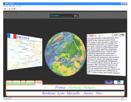
Figure 5: Information Display in English

XLIFF/MLIF document. Figure 5 shows the same application once user has chosen to see information in English.