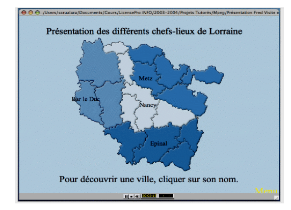
Figure 2: An Interactive MPEG-4 Presentation in French.