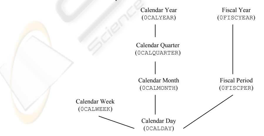
Figure 1: Hierarchy of SAP BW time characteristics

There is a difference between complete and incomplete time characteristics: The complete time characteristics are the SAP BW time characteristics calendar day (OCALDAY), calendar week (OCALWEEK), calendar month (OCALMONTH), calendar quarter (OCALQUARTER), calendar year (OCALYEAR), fiscal year (OFISCYEAR) and fiscal period (OFISCPER). They are clearly assigned to a point in time.