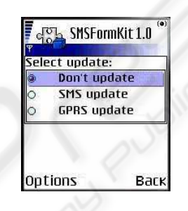
Figure 6: Update selection

or downloading it by SMS or GPRS using the update feature (see figure 6).