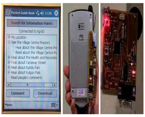
Figure 1: a) Menu Browser on the IPAQ – b) Pointer prototype – c) Tag prototype

The other method that a user may employ to access information from the IPSN is by way of a pointer (Figure 1b) and tag (Figure 1c) system also developed for the purposes of this scenario. This pointer-and-tag system allows the user to point to the specific information they require, without the need of connecting to a particular IPS and searching through a menu for the information they require. The pointer is attached to the MCD, and the user intuitively points this to the tag associated with the information they would like to view. The user's experience of an information item once it is downloaded via Bluetooth is the same regardless of how the user selected it.