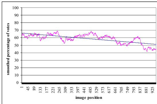
Figure 3: Ranking of query result for Color Temperature descriptor (moderate category)