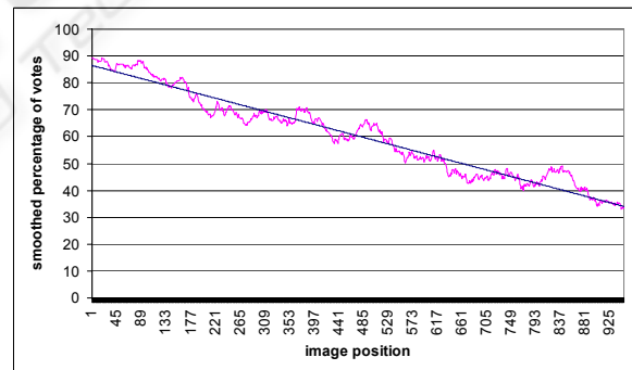
Figure 2: Ranking of query result for the dominant-color-based extraction algorithm

Additionally, the graphs contain lines which best fit the smoothed relationships for the two descriptions. The line parameters were obtained by linear regression of the data. The equation of the approximated line is y=a*x+b , where x is the image position (horizontal axis of the graph), y is the smoothed percentage of votes value, a is the slope of the line, and b is the intersection of the line with the vertical axis of the graph (intercept, percentage of votes for the first positioned image on the retrieved list). Table 1 shows start points ( b parameter values) of the lines for all of the four subjective color