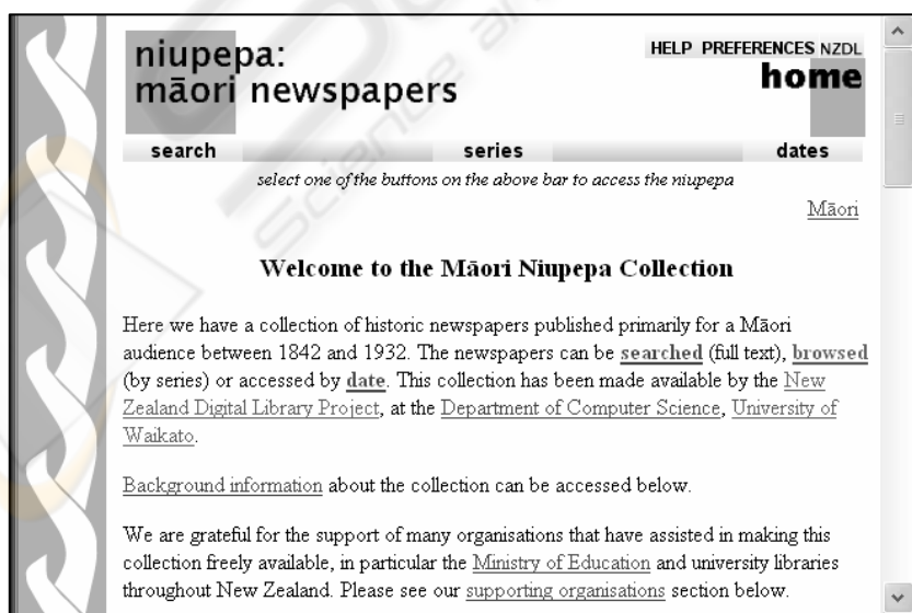
Figure 1: Home Page of the Niupepa Website

70% of the documents are written in Māori, 27% are written bilingually in both Māori and English, and 3% written in English only. The collection is a rich source of Māori language texts in an environment where there is a dearth of Māori language resources. The default language of the collection is normally set to Māori.