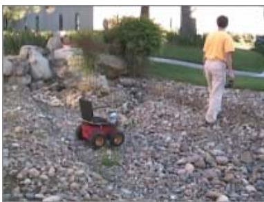
Figure 6: Traversing rough terrain