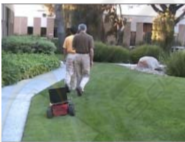
Figure 7: Coping with partial occlusion