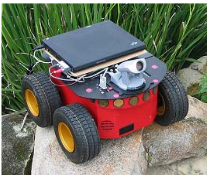
Figure 3: The rover used on experiments

The robot base used in the experiments was an ActiveMedia Pioneer2 All-Terrain rover, as shown in Fig. 3. The base dimensions are 50 \times 49 \times 26 cm, has four motorized wheels, and can travel at a top speed of 1.6 m/s. The Pioneer 2 is capable of holding 40 kg and has a battery life of 10-12 hours. The robot has a sonar ring with 8 sensors, which has an operation range of 15 cm to 7 m. The sonar sensors, seen in Fig. 3 as circles, are used for obstacle detection. In case obstacles are detected, a collision avoidance maneuvering, not described in this paper takes place.