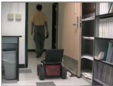
Figure 4: Passage through a door