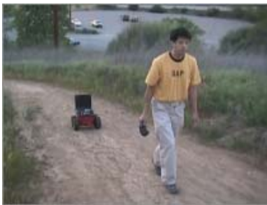
Figure 5: Following a steep dirt trail